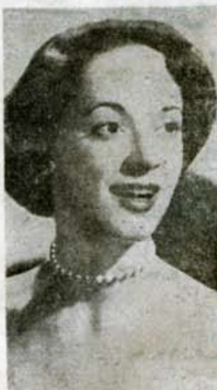
GISELE MACKENZIE 7-8 p. m., Channel 5.