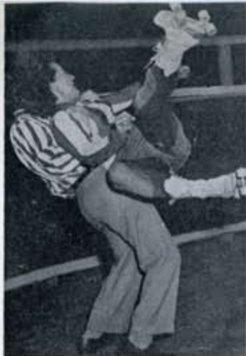
"Leggo! Leggo! I say!"