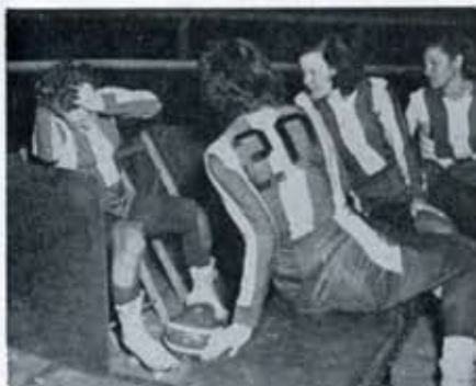
"Aw, now we're in for it."