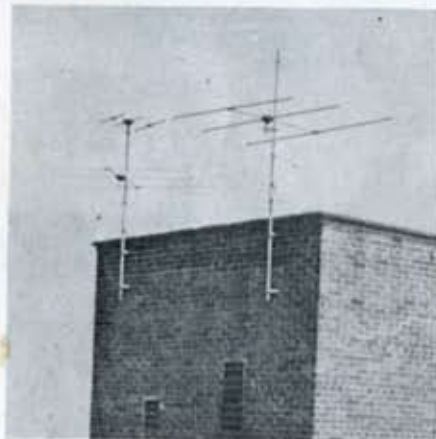
View above shows installation of master antenna, located atop prominent north shore apartment building.

An experiment of installing a master antenna to serve a large number of residents in an apartment dwelling has proven a success in Chicago.