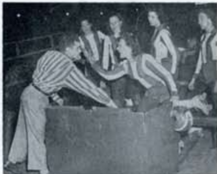
"I didn't do a thing!"