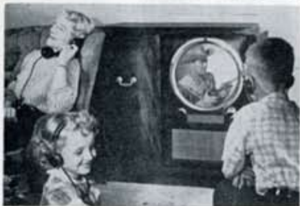
Mom relaxes while the children watch TV and listen thru special headphones.

Two manufacturers are currently offering headphones to personalize television enjoyment. Knowing that some folks like their video to sound loud, and some like it soft, they've come up with an audio control unit allowing youngsters to choose their own volume.